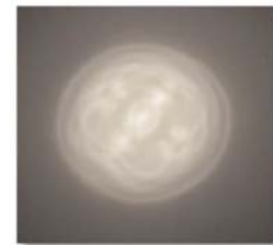
Spot From Collimated Light (no diffuser)