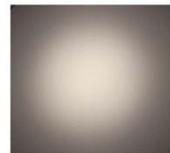
Collimated Light with M-Series Mixing Diffuser